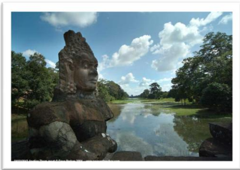
Angkor Thom Moat

I wrote this after my first visit in 2002. Ta Prohm and the temples have changed a lot in the last few years and visitor numbers have increased. In spite of this; Ta Prohm is one of the Wonders of Cambodia and is justifiably near the top of places to see here!